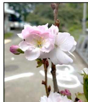
Cherry trees planted in March (Amanogawa) have blossomed.

Welcome to Mihara Junior High School, 241 students! Congratulations on your studies. Also, today is the start of school life where the Corona Virus infection is subsiding. As normal life is returning one step further than last year, we are able to hold the entrance ceremony which makes me happy. In addition to what I mentioned earlier, Mihara Junior High School also welcomes 232 students to the 2 nd grade and 239 students to the 3 rd grade who have just advanced to the next level today.